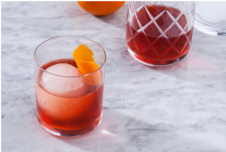
The Verge Negroni (Veroni).