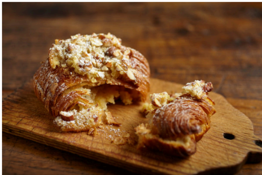
An almond croissant from Manresa Bread.