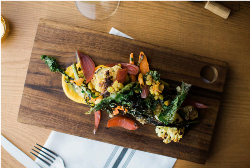
Zola's Assiette Jardinière: a seasonal selection of prepared vegetables.